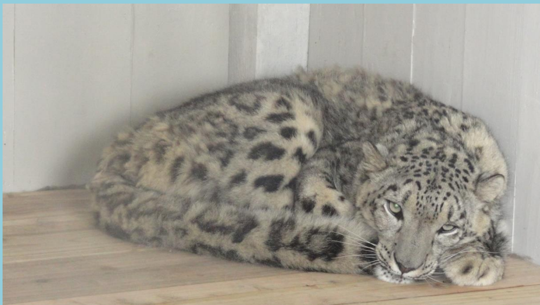
Namkha at the conservation breeding centre for Red Pandas and Snow Leopards at Topkeydara, Darjeeling

On 1 st September 2016, Darjeeling zoo welcomed a new member to the family, a male snow leopard named Namkha, aged 2 years 3 months, from Mulhouse zoo, France as a part of the exchange programme for contributing to the Conservation breeding programme of Snow leopard at Darjeeling zoo. Namkha arrived at Kolkata via Amsterdam on 31 st Aug 2016 and was brought to the Conservation breeding centre for Red pandas and Snow leopards at Topkeydara, Darjeeling the day after, where he was quarantined for 30 days and the appropriate vaccines were administered to him before being brought into contact with other inhabitants at the centre. Namkha is a valuable addition to the already successful conservation breeding program of snow leopards at Darjeeling zoo.