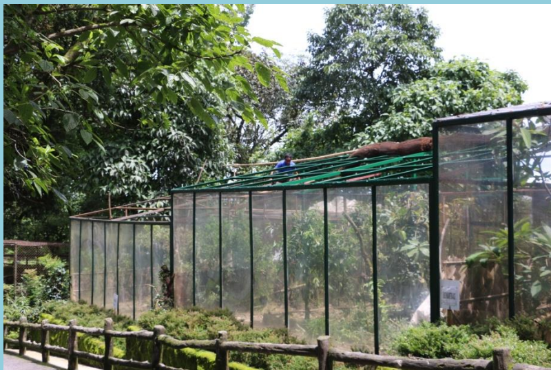
Slanting of roof of the pheasantry