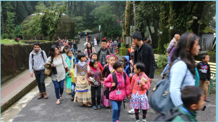
Educational tour of St Edmins English Institute