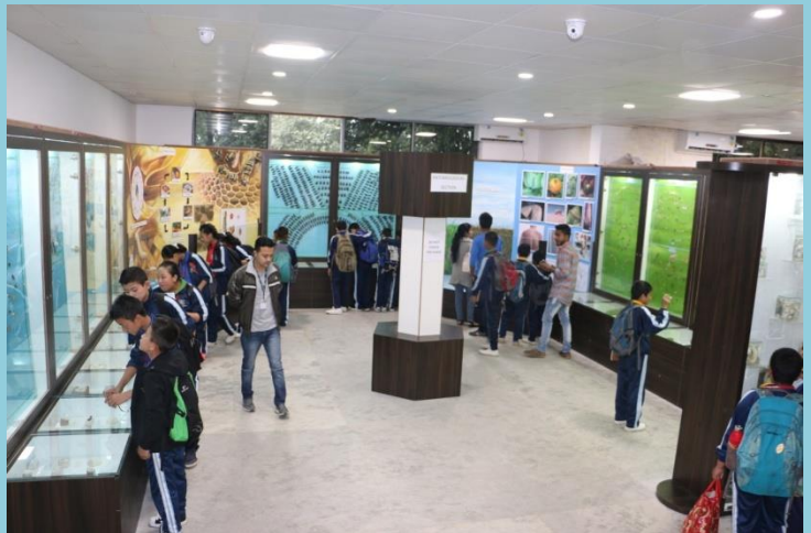
Educational Tour of Greenhill English School