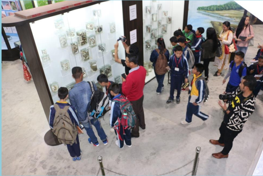
Visitors at the Bengal Natural History Museum

The museum was handed over to the park on 07.01.2010 and construction of the new building and shifting of specimens was completed by August 2015. The visitors can see a collection of fauna of North Bengal and the Eastern Himalayas in the museum. The museum maintains 2922 rolled birds, 47 rolled mammal skin and 52 well maintained flat mammalian skin along with specimens of butterflies, moths, dragonflies and beetles. The museum also maintains a small taxidermy unit.