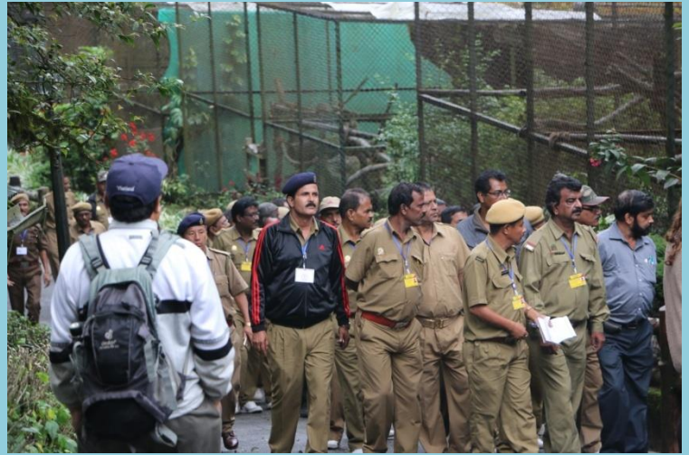
Training for DR/Fr from Forestry Training Centre, Rajabhat Khawa