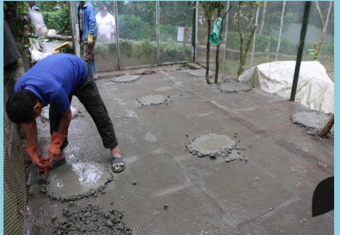
Predator proof substrate for the pheasantry