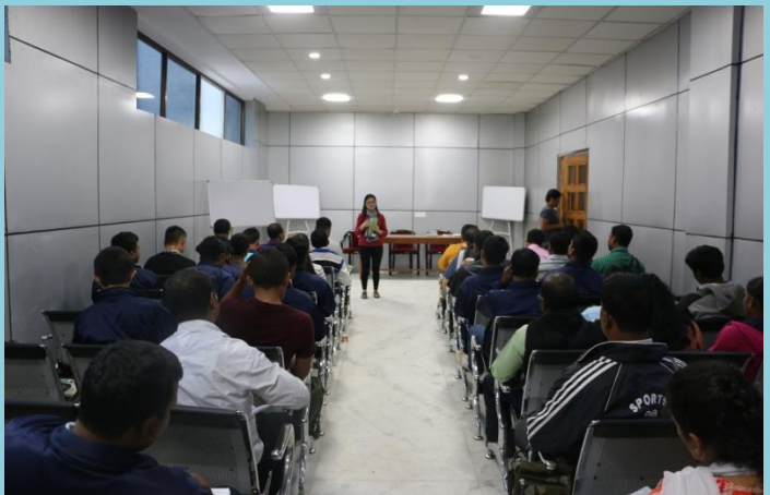
Training of 106 th Batch of DR/Fr from State Forest Training Institute, Hijli