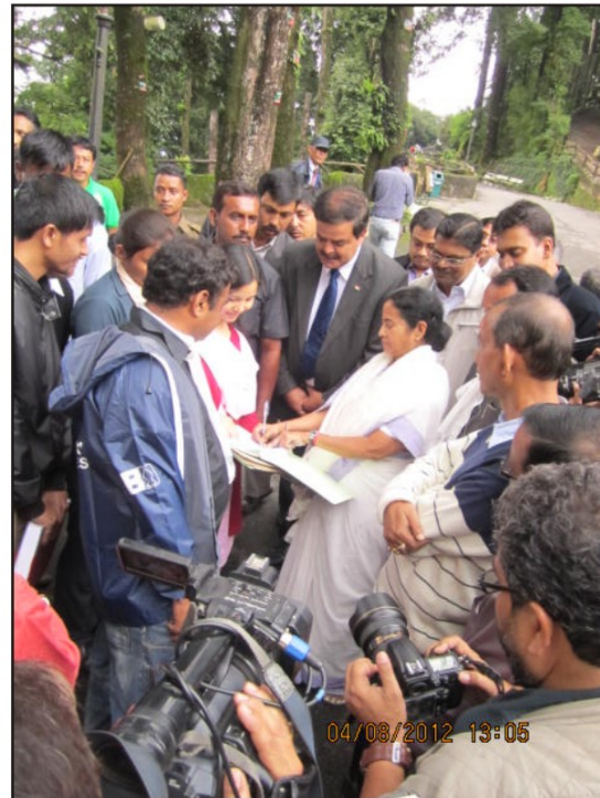
Hon'ble Chief Minister of West Bengal Miss Mamata Banerjee named the new born cub of Red Panda as “Smile” and cub of Snow Leopard as “Rare” on her visit to the Park on 04.08.2012.