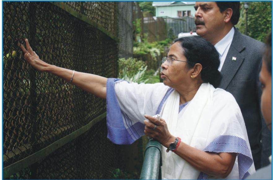
Hon'ble Chief Minister of West Bengal Miss Mamata Banerjee on her visit to the Park on 04.08.2012.

Padmaja Naidu Himalayan Zoological Park Darjeeling -734 101 (West Bengal) India Tel : +91- 354 - 2254250 (Ch) 2253709 (Off), 2252522 (Fax) E-mail : pnhzp@yahoo.com Web. : www.pnhzp.gov.in